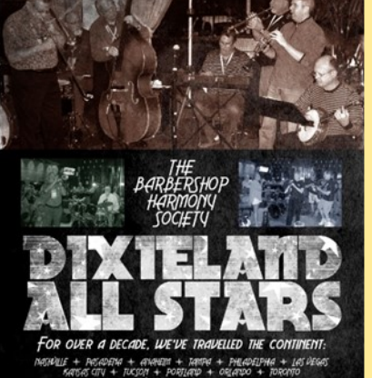
E, SING WITH US! DANCE WITH US

Mixed Harmony Showcase 10pm - 1am, PH - Mezzanine