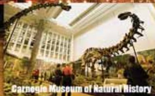
Carnegie Museum of Natural History