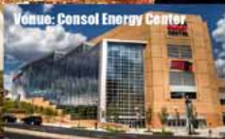
Venue: Consol Energy Center