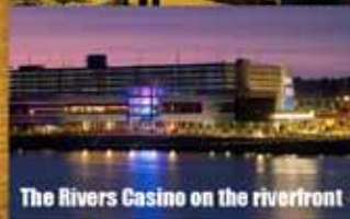
The Rivers Casino on the riverfront