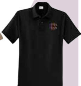
Signifier Men's Polo