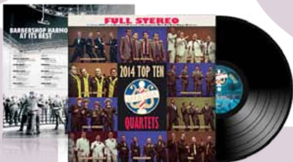
Las Vegas "Limited Edition" Top Ten Quartet Vinyl Album

And much more! Come see us in the Marketplace