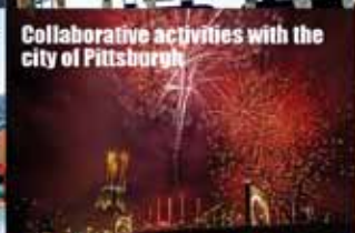
Collaborative activities with the city of Pittsburgh