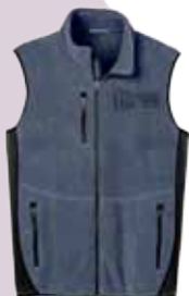
Blue Fleece Vest