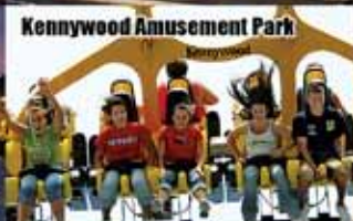
Kennywood Amusement Park