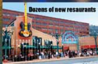
Dozens of new resaurants