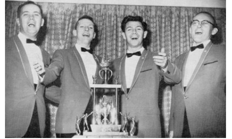
Sidewinders: 1964 International Champion