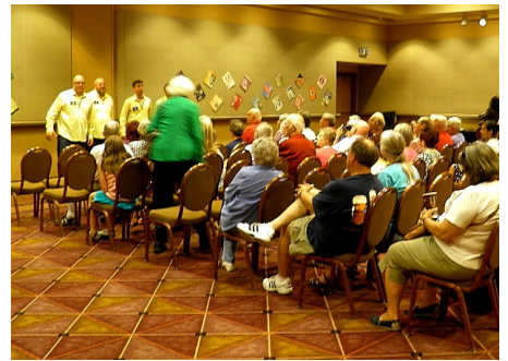
Masterpiece performing at the Ladies' Meet & Greet on Thursday, July 3.